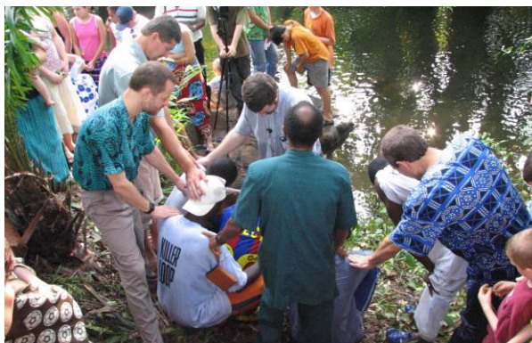
The local Boké Pastor Moirés Prays for the believers after the Baptism.

In November I had the privilege of witnessing the first two Landuma village baptisms, in the villages of Kimiya and Hamdallaye. Six Landuma and one Susu believers were baptized. Before each believer was baptized they each gave a profession of their faith. Each of the believers said that they would follow Christ no matter the cost.