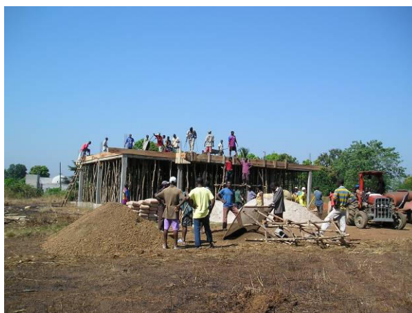
The Boké Church Under-Construction.

During this phase of the construction the second story floor was being poured. In order to achieve the strength needed to support the weight, it was essential to