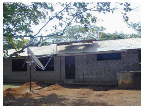
The VSAT dish and the solar panels used to power it.