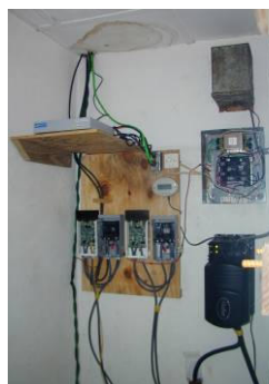
Some of the VSAT power equipment

With this new internet connection we are able to better communicate inside and outside of Guinea, and students at the mission school are able to do research projects using the internet.