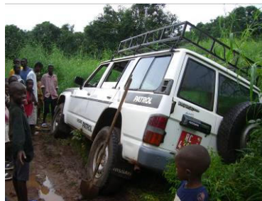
It took some work to get the truck I was driving out of this ditch, while working in a tribal village.