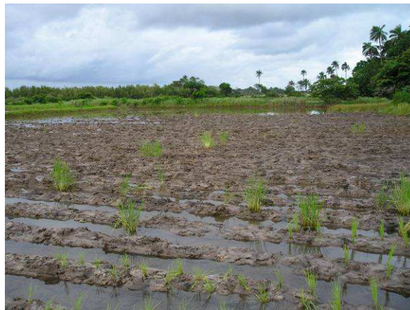
Rice fields in the village of Tarencha