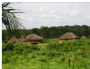
Tribal huts in the village of Ojague.

I have been to all of the villages where New