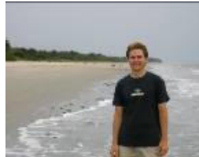
Hello from the Island of Katufra.

We were able to inspect the missionaries houses and clean up some ter-