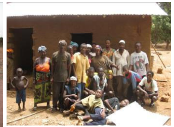
The school in Hofia we helped to roof