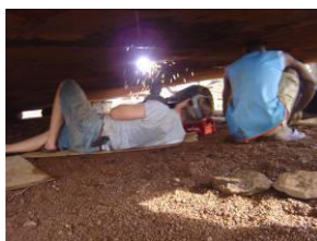
Welding upside down is not easy!

We spent about a week bailing water, cleaning the rust off, and what seemed to me to be endless welding. We were able to repair most of the holes. There is still some additional work which needs to be done, however the villagers will be able to finish it themselves. Pray that God will bless our work.