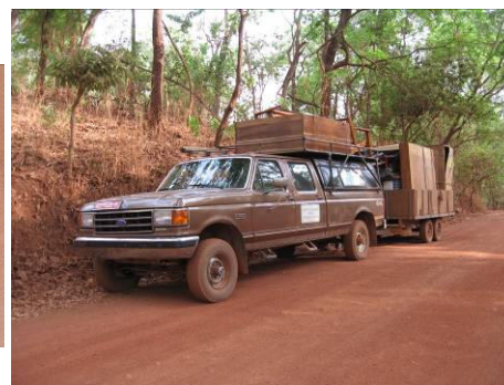
Moving to the Konyagui Town

missionaries join their team. Please keep the Konyagui missionaries and people in prayer.