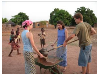
Sifting sand to work with on the house in the Konyagui Town