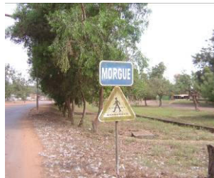
Dead Man Walking??