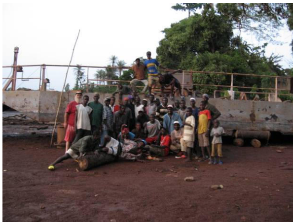
The guys who helped repair the ferry.