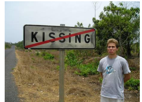
Leaving the village of "Kissing".