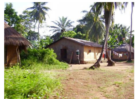
Life in the Baga-Fore tribe.

village since they arrived, and have almost completed building a new medical clinic. They will now petition the Guinean government to post a Guinean doctor in the new clinic soon.