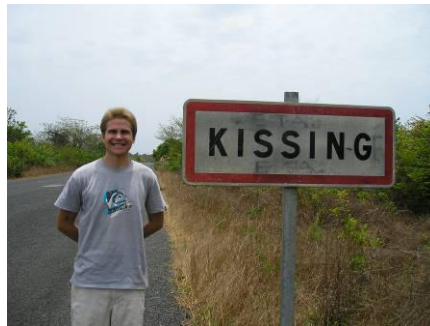
Entering the village of "Kissing".