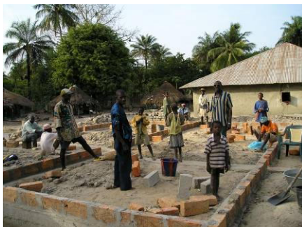
Nalu men build a village house.

Nalu/Susu tribe: The reception of the Gospel was initially less than enthusiastic among Nalu/Susu people. However, God is working in their lives and changing hearts. The missionaries are meeting with a small group of believers every Wednesday, and continuing to